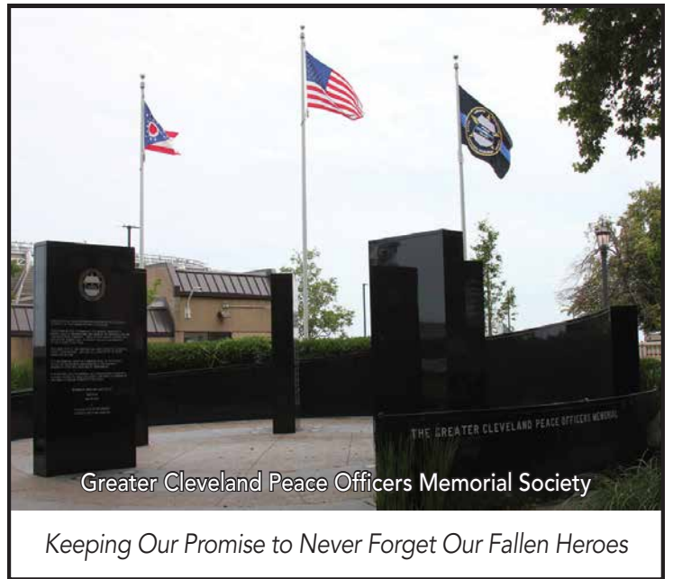
Greater Cleveland Peace Officers Memorial Society

This year's Tattoo was held at Cleveland Public Hall. It was great to see our friends from Ottawa Police Service Pipes and Drums and dancers make a return after a few years due to the pandemic. Murphy's Irish dancers also returned this year. I want to thank the Red Hackle Pipes and Drums, United States Army Silent Drill Team, US Air Force Band, North Coast Pipes & Drums